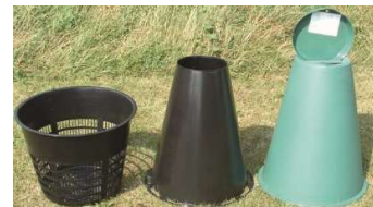
Basket Black-Cone Green-Cone

Tools Required: Flathead & Phillips Screwdriver